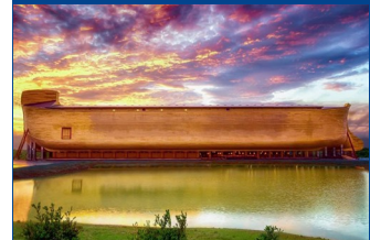
Enjoy a visit to the Famous Ark Encounter!